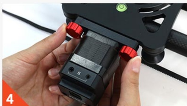
4 Mount the motor on the camera plate of the slider.