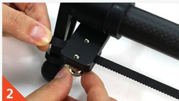
2 Insert the belt and tighten with two knobs.