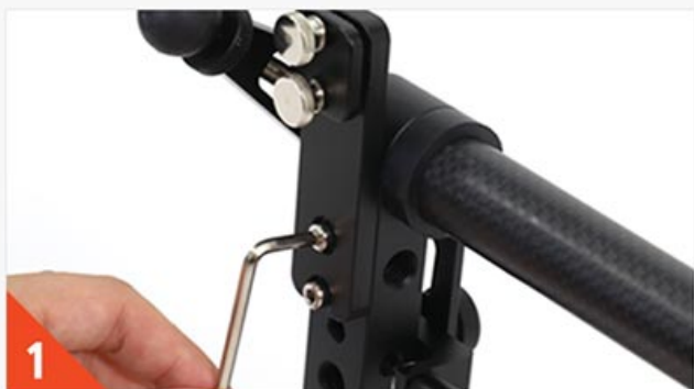
1 Mount 'Belt Block' beneath the end of the slider.