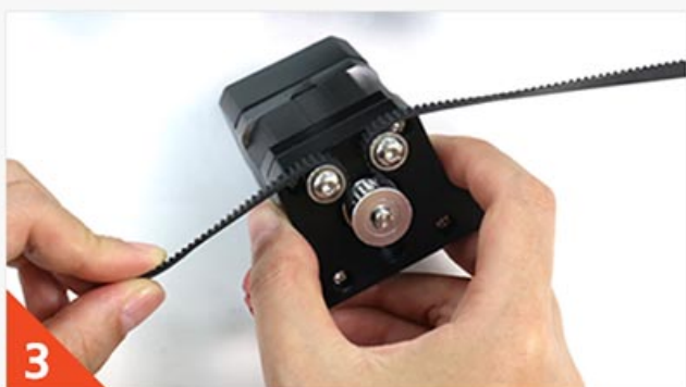
3 Mount the belt on the pulley and bearings.