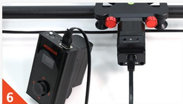
6 Connect the motor and the controller with Lan cable.